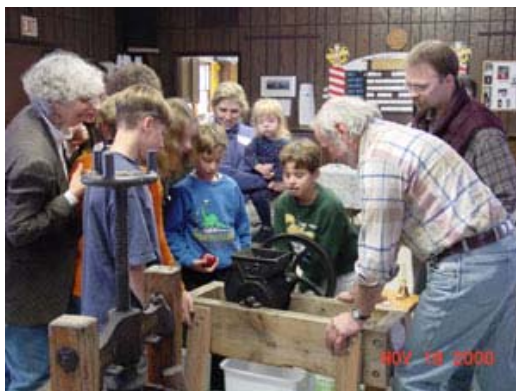
Intergenerational Service, making apple cider, Nov 2000